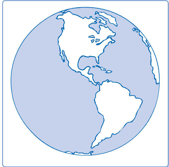
▲ Figure 1-1. Over 70 percent of the Earth's surface is covered with water.

It is covered mostly with water. (See Figure 1-1.)