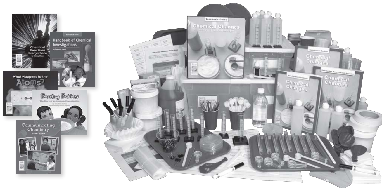
Chemical Changes Science and Literacy Kit

To learn more about Seeds of Science / Roots of Reading ® products, pricing, and purchasing information, visit www.deltaeducation.com